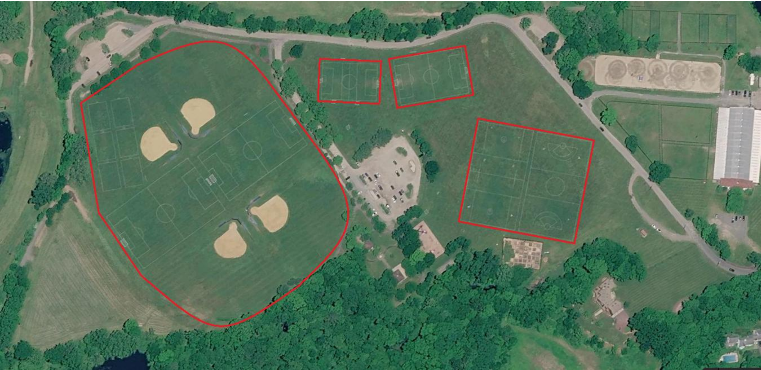
Exhibit A - Settlers Park - 280 Crook Horn Road