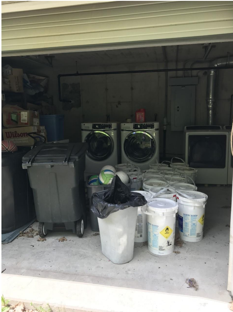
Photograph 1 – Edgewood Bath and Tennis Club, 100 N Benson Road, Middlebury 5-22-2020

Photograph 1 displays the inside of the storage shed that is located underneath the pool deck. There were approximately 17 white containers with chlorine tablets.